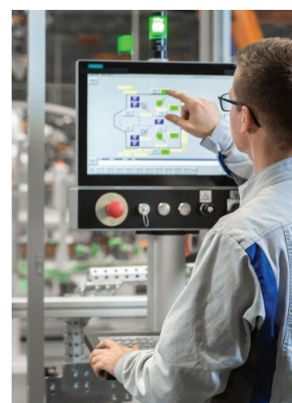
TRANSPORT & LOGISTICS