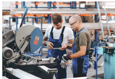
INDUSTRIAL – SHOP FLOOR