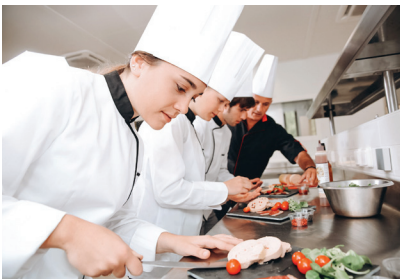
KITCHEN & CATERING