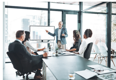
OFFICE & BOARDROOM