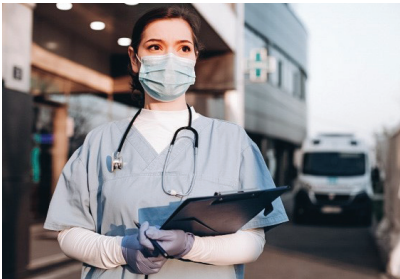
PERSONAL CARE & PPE